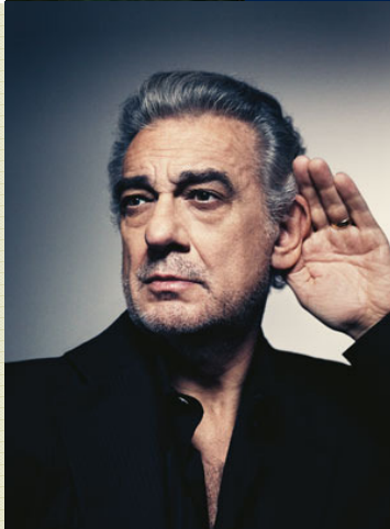
Plácido Domingo